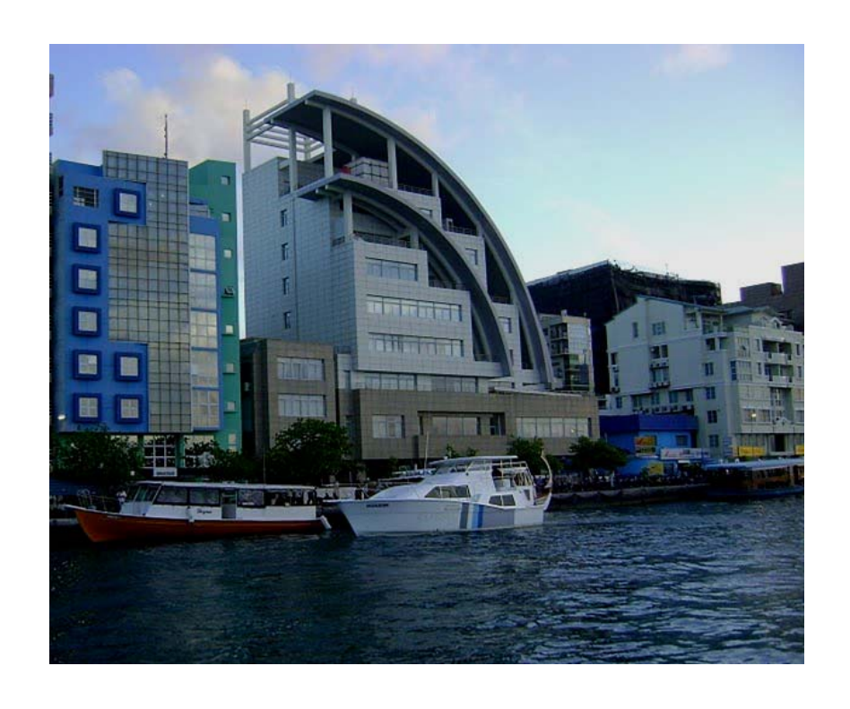
Foreign Policy of the Maldives building resilience, making Maldivians proud